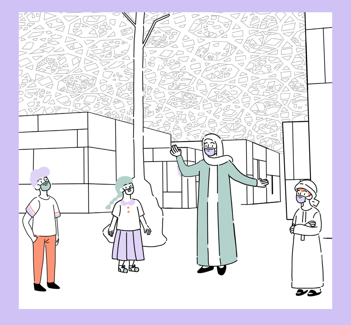
In The Museum