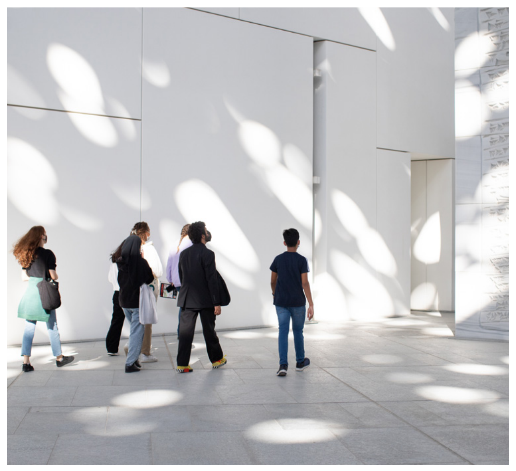
@Department of Culture and Tourism - Abu Dhabi / Photo: Raheed Allaf of Seeing Things