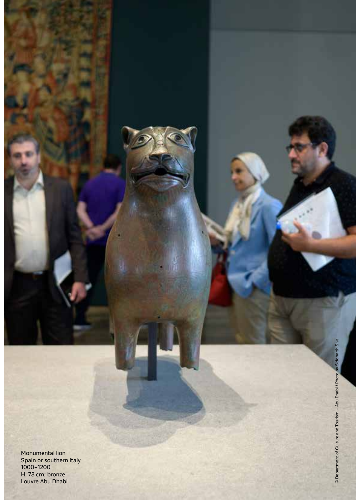
Monumental lion Spain or southern Italy 1000-1200 H. 73 cm; bronze Louvre Abu Dhabi

Since opening in 2017, Louvre Abu Dhabi has become a unique space that brings people together. Welcoming visitors from around the world who have come to enjoy the museum's rich cross-cultural collection, iconic dome, ground-breaking international exhibitions, and a range of cultural programmes for people of all ages and backgrounds.