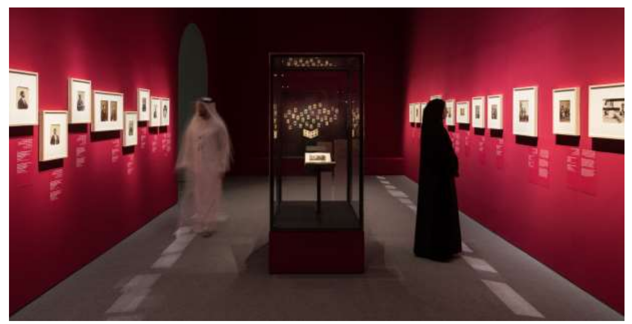
A selection of the world's earliest photographs at Louvre Abu Dhabi

From April 25 to July 13, visitors will explore more than 250 of the earliest photographs in the world, including images from Saudi Arabia, Egypt, India, the Philippines and elsewhere